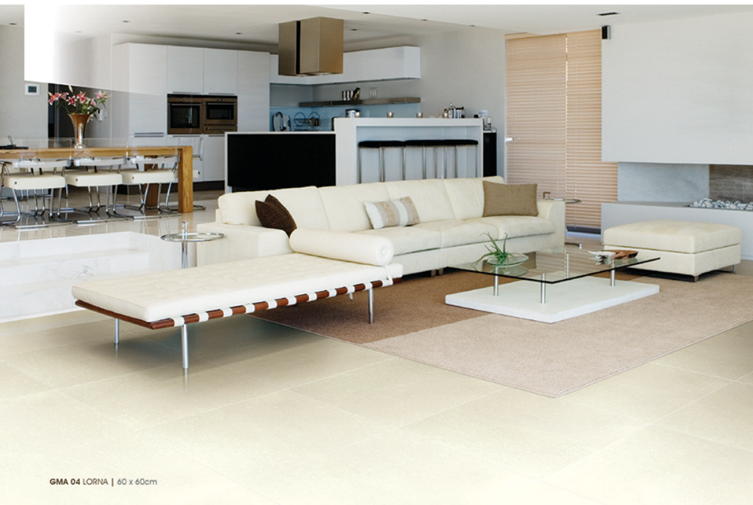
GMA 04 LORNA | 60 x 60cm

Experience comfort in space. Indulge in colours that broaden perspectives, create panoramic horizons to home and work place that are soothing to the eyes and gratifying to the senses. Spazioso sets your imagination free, filling tight corners with illusions of space and capacity.