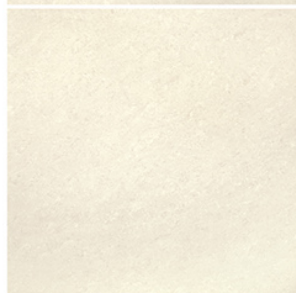
GMA 02 CAROLINA 60 x 60cm Polished