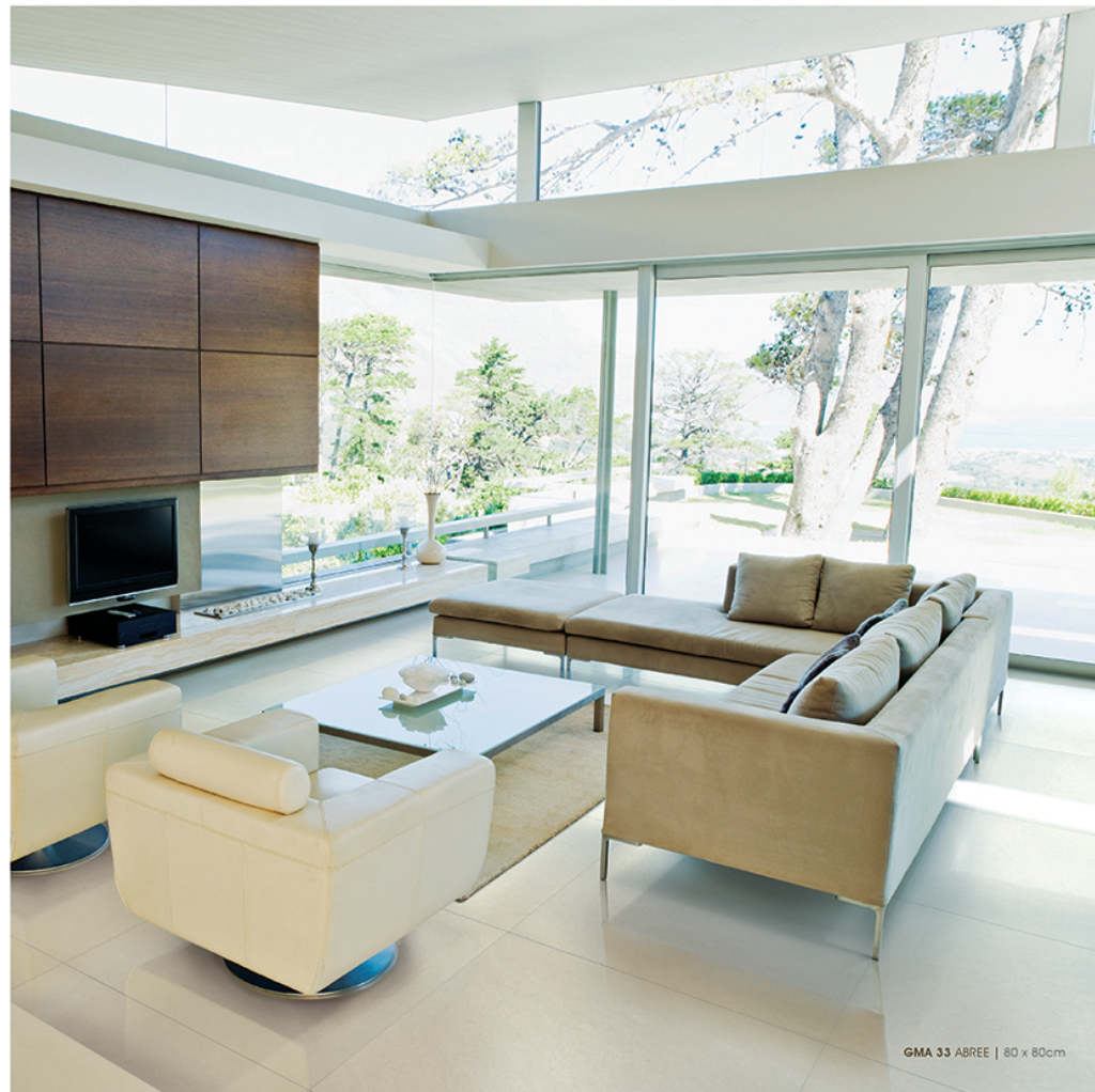
GMA 33 ABREE | 80 x 80cm