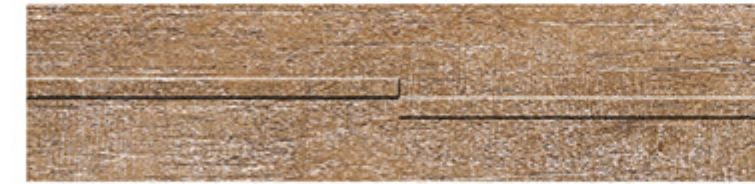
GDW12 DECO B | 60cm x 15cm