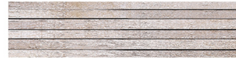
GDW10 DECO A | 60cm x 15cm