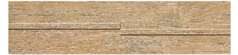
GDW83 DECO B | 60cm x 15cm