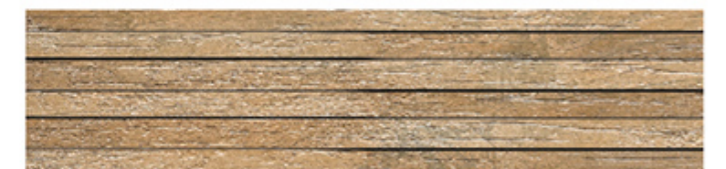
GDW83 DECO A | 60cm x 15cm