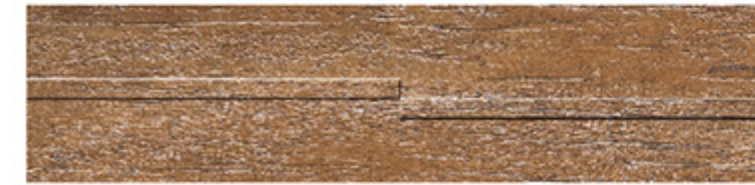
GDW15 DECO B | 60cm x 15cm