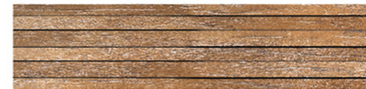
GDW15 DECO A | 60cm x 15cm