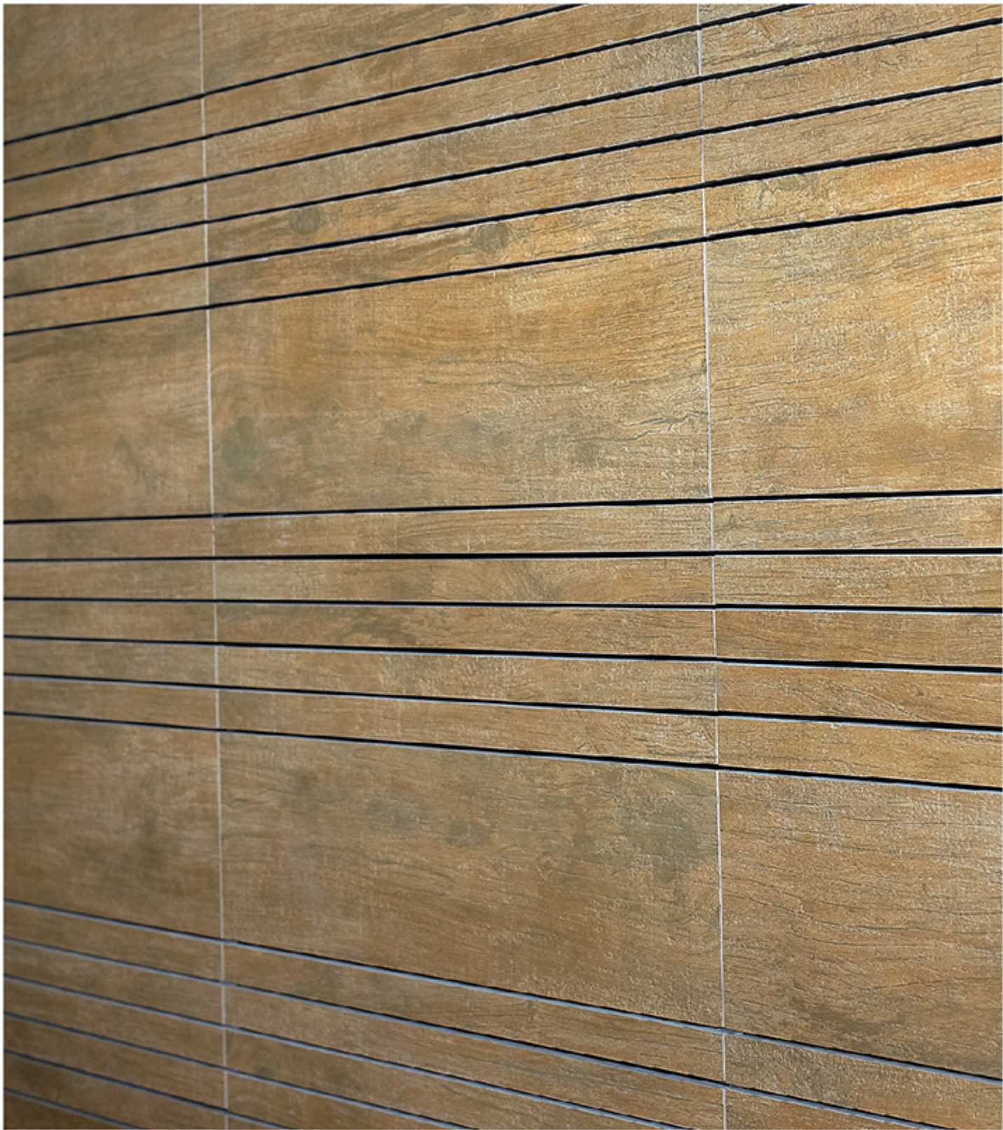
signature of genuineness with each images' individuality