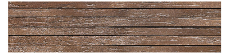
GDW16 DECO A | 60cm x 15cm