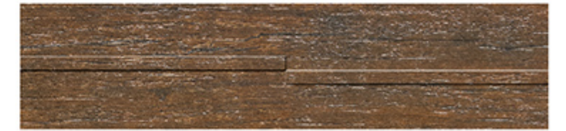
GDW88 DECO B | 60cm x 15cm