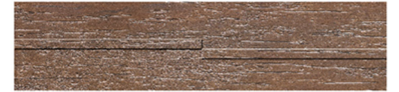
GDW16 DECO B | 60cm x 15cm