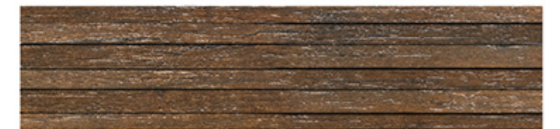
GDW88 DECO A | 60cm x 15cm