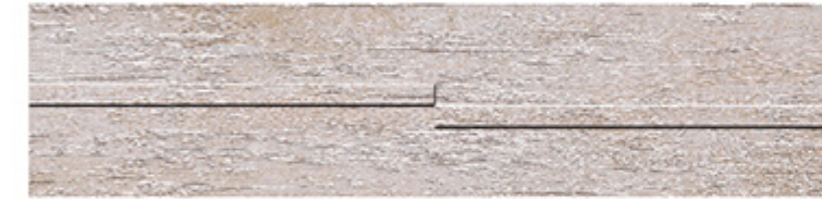
GDW10 DECO B | 60cm x 15cm