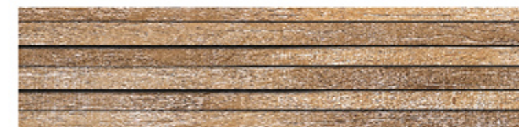
GDW12 DECO A | 60cm x 15cm