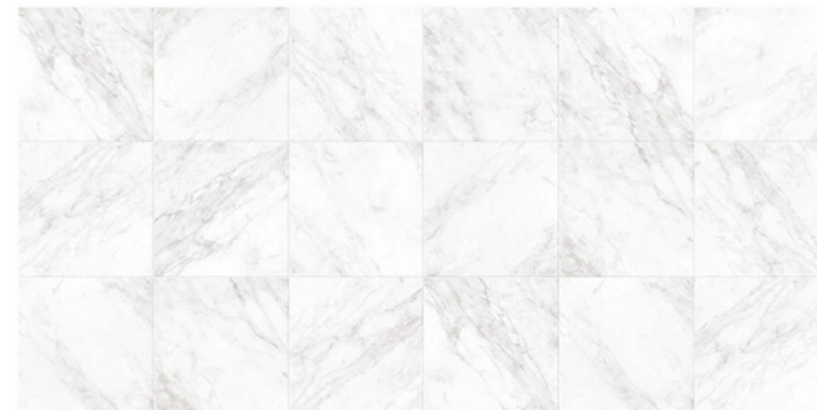
WALL | CALACATTA WHITE GBP10 Polished 80x40cm

BELLEZA PORCELANA × × BRILLIANT SHINE × ×