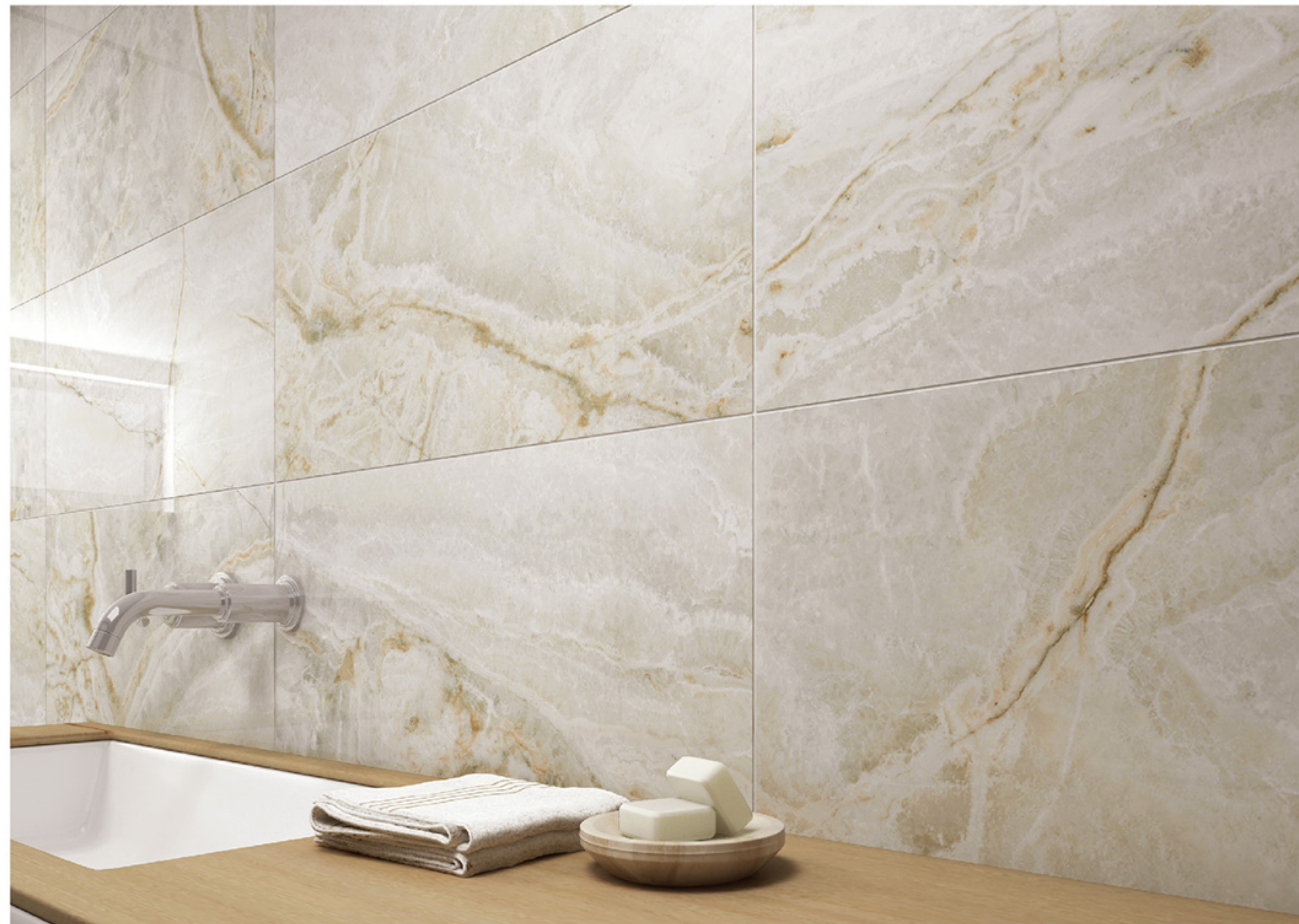
WALL | BURBON BEIGE GBP20 Polished 80x40cm