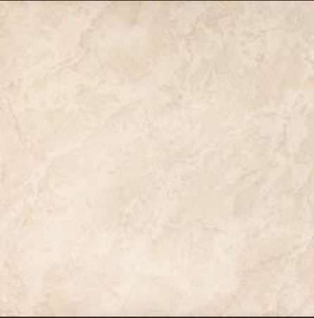
GMA40 | VANESSA 40*40