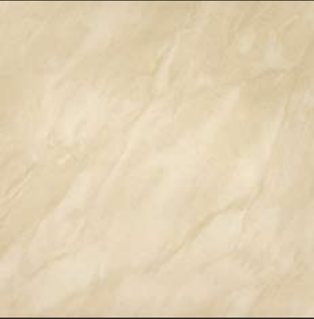
GMA42 | KIMBERLY 40*40