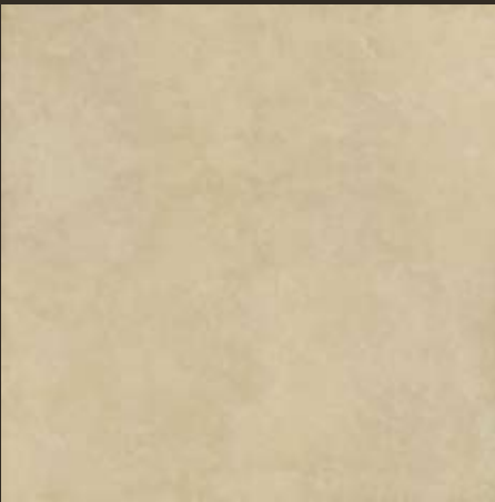
*GMA12 | NORA 60*60