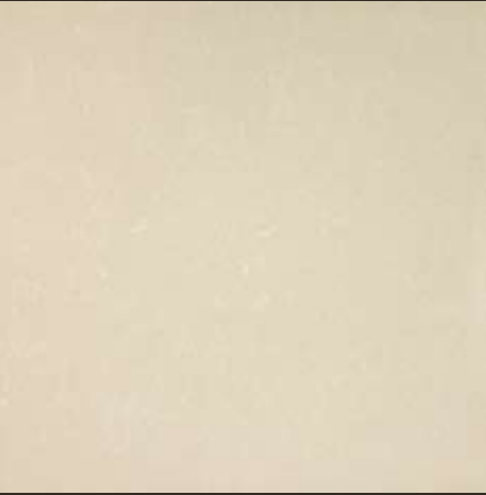
*GMA33 | ABREE 60*60, 80*80