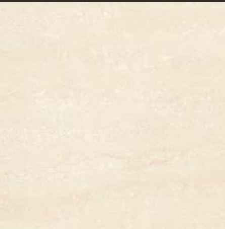
*GMA86 | RACHELE 80*80