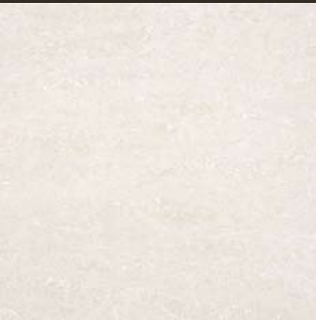
*GMA87 | VENUS 80*80