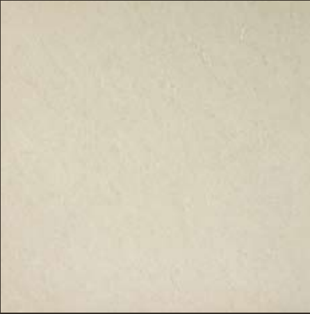
*GMA34 | CAREENA 60*60, 80*80