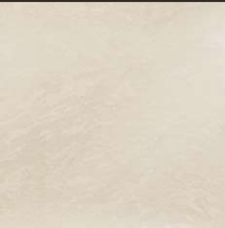
*GMA17 | BELLA 60*60