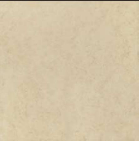
*GMA09 | LIZ 60*60